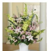
Your donation is greatly appreciated

Our weekly flower expense is approximately $100 and we could use your help. If you feel led to donate to our Flower Fund, donate flowers for a specific Sunday, Occasion or in Memory of a loved one, please Venmo @Mele-Tafao with a comment of "Flower Fund" and details or contact any of the Church officers.